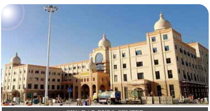
GWADAR EXPO CENTER